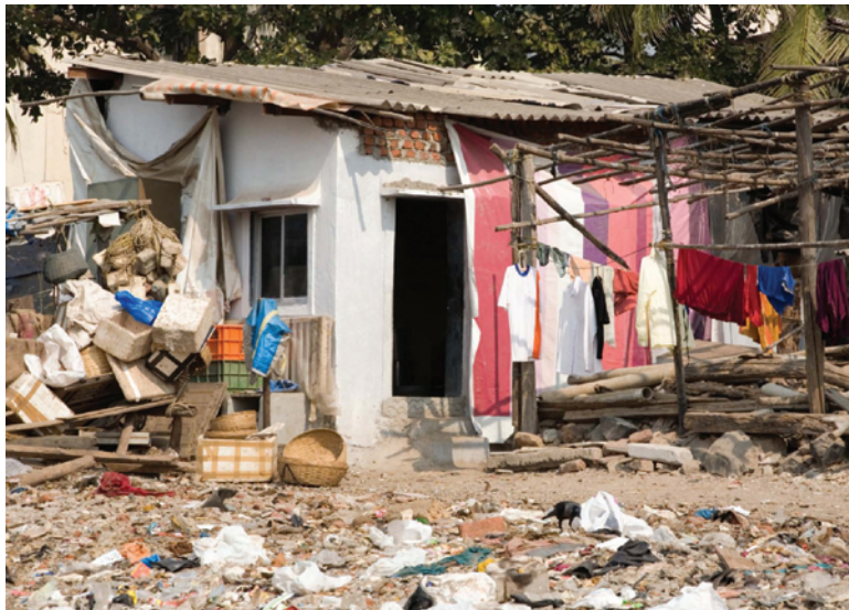
Figure 3 Signs of poverty in Uganda.

number of doctors, nurses, midwives, and health care workers that are needed; the deficit in Africa.” And he made the point that we must address that urgent need. But if you’re going to really make a difference in the capacity of Africa to deliver its own health care and to break free of this dilemma, you need to work at the top of the pyramid. You need to be building and strengthening centers of excellence, creating better and stronger medical schools, nursing schools, hospitals, and clinics.