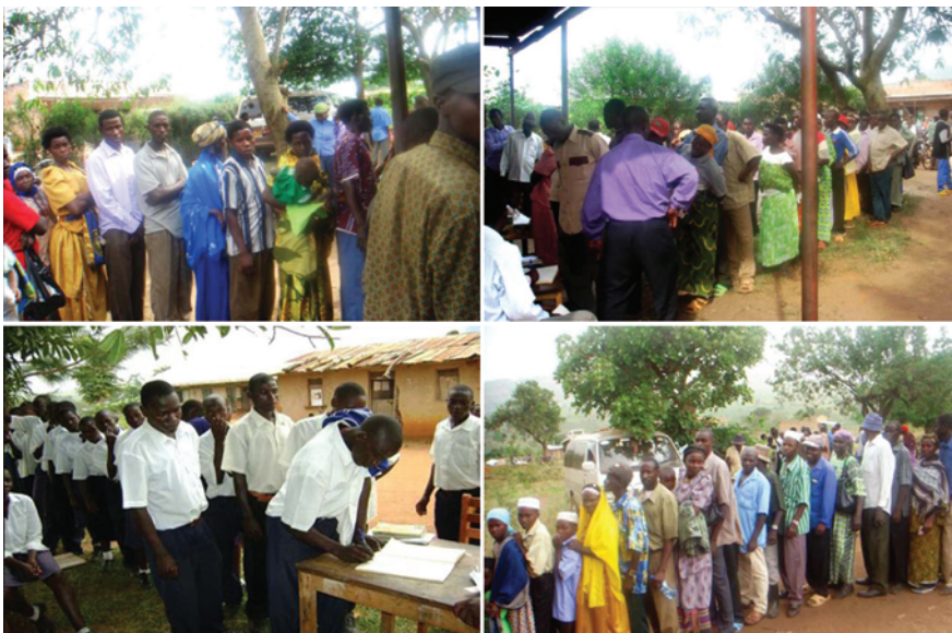
Figure 8 Ugandans seek HIV counseling and testing.