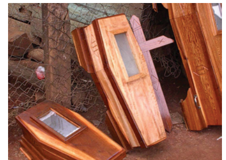
Figure 2 A burgeoning local industry in Uganda: the making of coffins, big and small, for the victims of HIV.