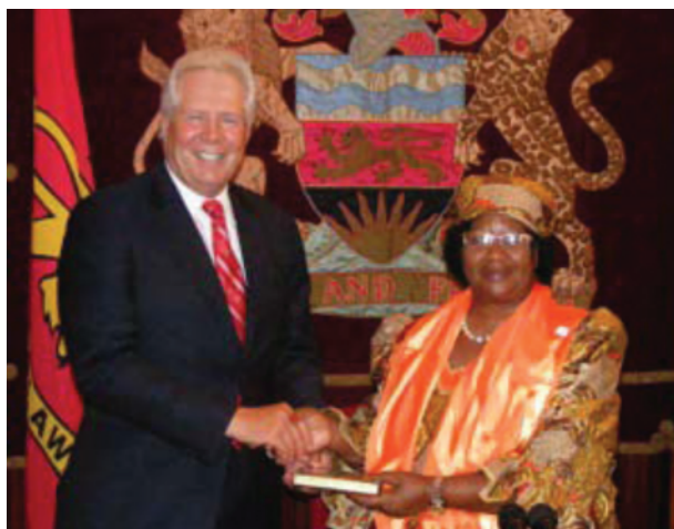
Figure 5 The author with Malawi President Joyce Banda.

In terms of TB, it might surprise you to know that one-third of the world's population is infected with this bacterium, with 8.7 million new TB cases and 1.4 million deaths due to TB in 2011. Indeed, TB is the leading killer in individuals who are infected with HIV, causing one-quarter of all deaths. Naturally, of concern is the spread of multidrug-resistant TB, which is present now in virtually all countries surveyed.